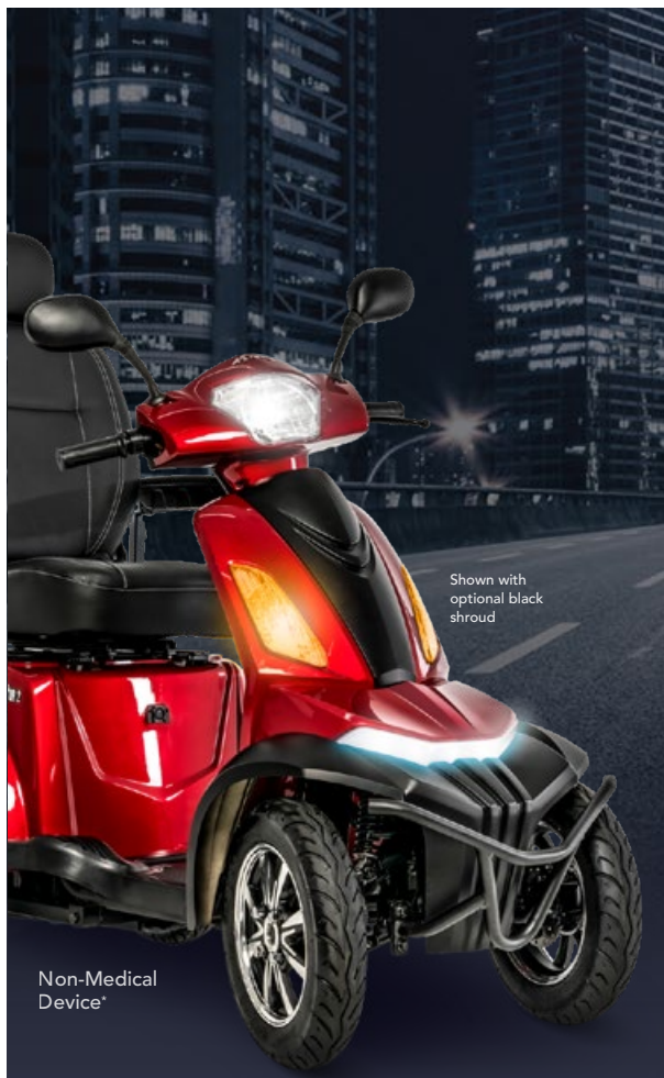
Shown with optional black shroud